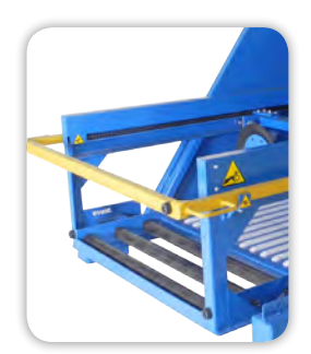
Battery Containment Bar

Ideal when batteries are too narrow for vacuum extraction