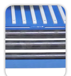
Compartment Rollers & Rear Friction Strips