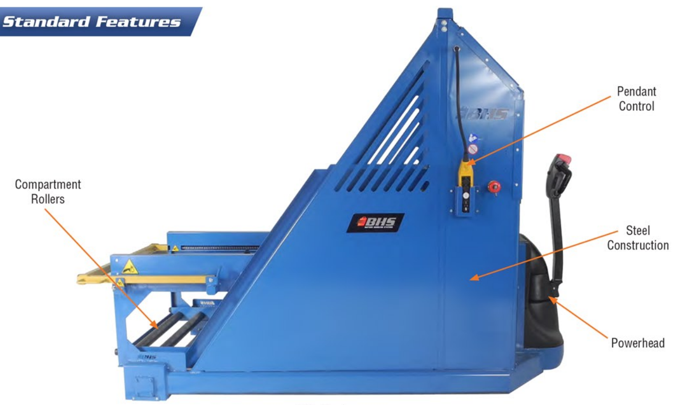
MBE side view