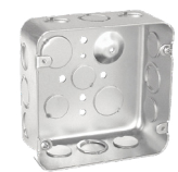
2-Gang Junction Box (Hardwired AC and/or DC)