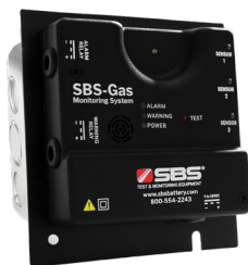
2-Gang Junction Box Hardwired AC and/or DC (optional)