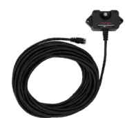
Additional Propane Sensor with 25 ft., 50 ft. or 100 ft. Cable