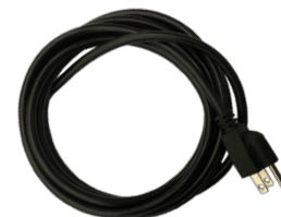
18 AWG AC Cord (optional)