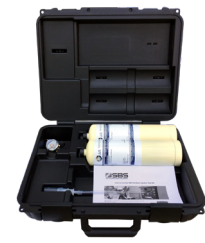
Test Kit (international orders ship without compressed gas)