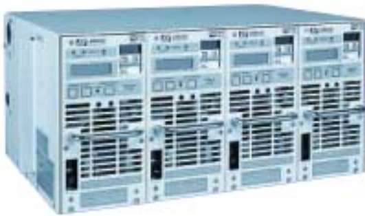
Modular Switched Mode Rectifier Systems (24V and 48V)