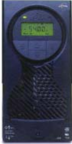
Modular Switchmode Rectifier (48V, 70amp)

Rectifiers/Inverters/Converters (1amp to 10,000amp Configurations)