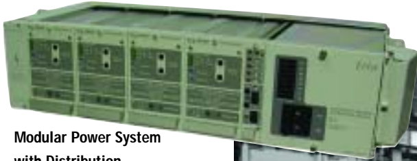
Modular Power System with Distribution