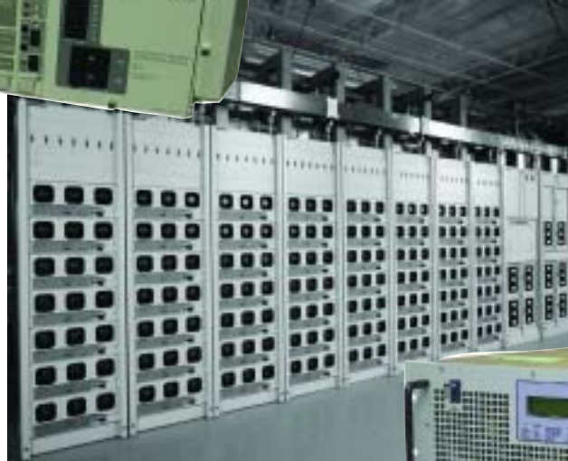
Power System (10,000amp to 48VDC)