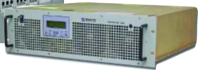
High-Power Density Rectifier (Three-Phase, 48V, 200amp)