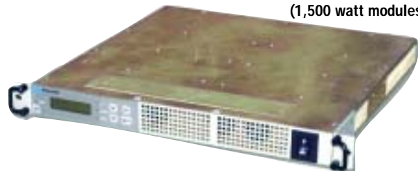
High Efficiency Power Inverters (1,500 watt modules)