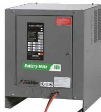
Typical forklift charging station examples