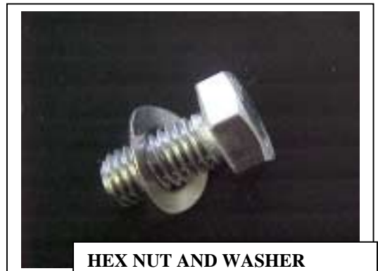
HEX NUT AND WASHER