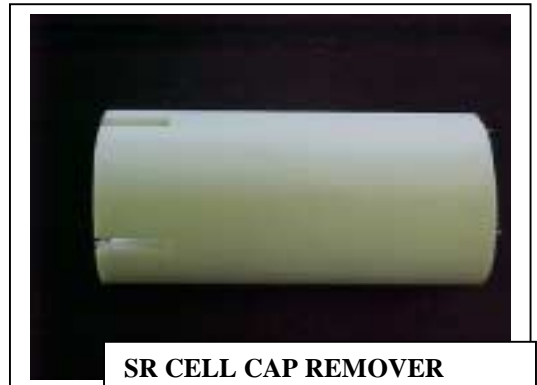
SR CELL CAP REMOVER