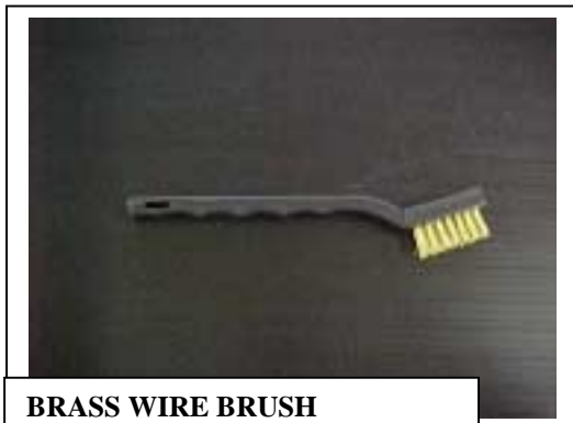
BRASS WIRE BRUSH