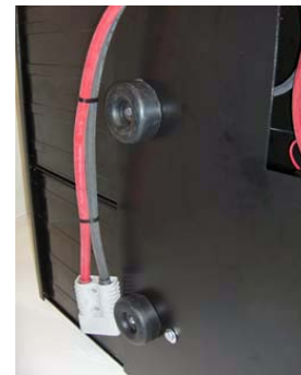
No need to stock two sizes. By simply removing 2 spacers, the 8.63" pack width is reduced to a 7.63" deep compartment.