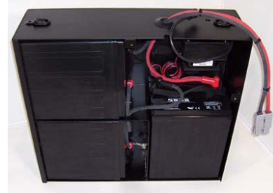
8 Volt battery design increases reliability by reducing the number of connections.