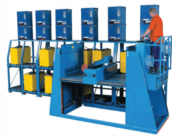
Double Stack Battery Extractor (BE-DS) pictured with batteries, chargers, and Double Stack System Stands