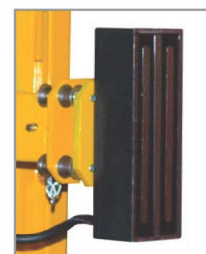
AVAILABLE MAGNET OPTION