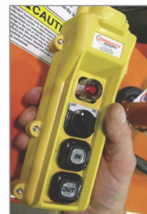
REMOTE PUSH BUTTON PENDANT