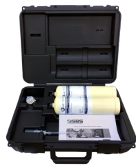
Test Kit (international orders ship without compressed gas)