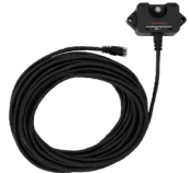
Additional Propane Sensor with 25 ft., 50 ft. or 100 ft. Cable