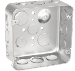
2-Gang Junction Box (Hardwired AC and/or DC)